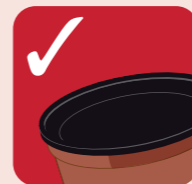
Plant pots and hard plastic