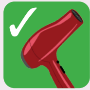
Anything with a plug