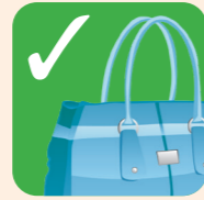
Bags and belts