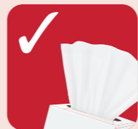
Tissues and wipes