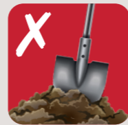
Soil and stones

Remember – Go to molevalley.gov.uk to sign up to the garden waste collection service and to buy a reduced price compost bin.