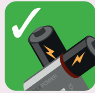
Batteries in a separate bag