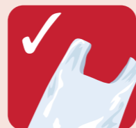
Plastic bags and cellophane