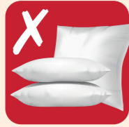
Pillows and duvets

Remember – Items must be clean, dry and in no more than one small, tied carrier bag placed next to your bin.