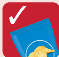
Crisp packets and wrappers