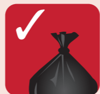
Black bin bags