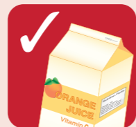
Food and drink cartons