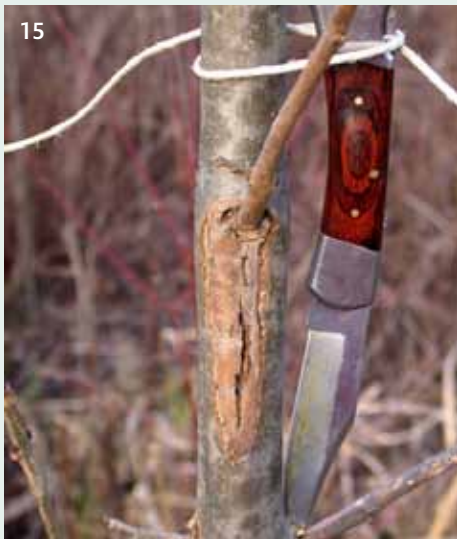
15 Old lesion centred on a dead side shoot.