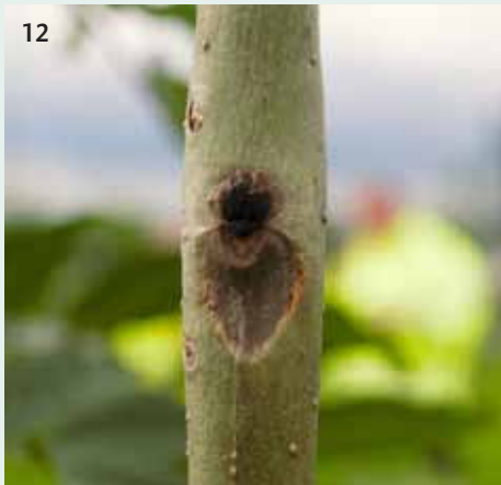
12 Older lesion associated with leaf scar.