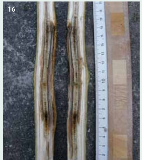
16 The wood and pith underlying bark lesions is usually strongly stained.