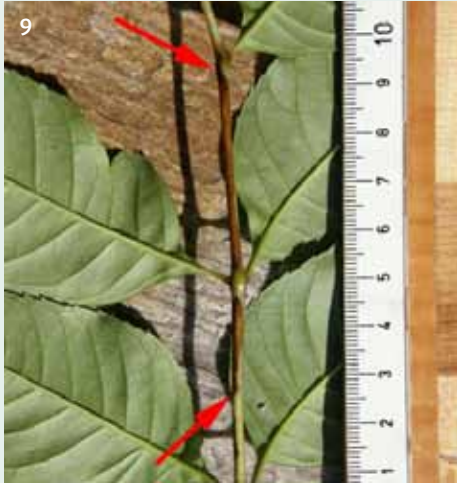
9 Lesion on rachis (ends arrowed) without leaflet symptoms.