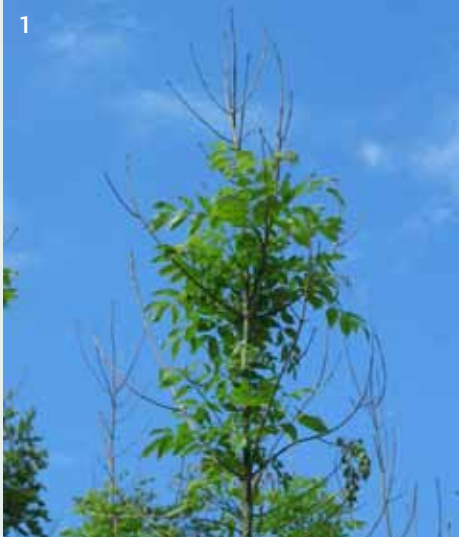
1 Diseased saplings typically display dead tops and/or side shoots.