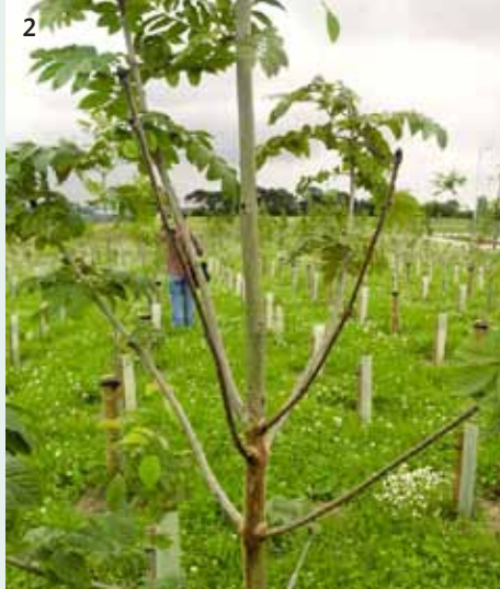
2 At the base of dead side shoots, lesions can often be found on the subtending branch or stem.