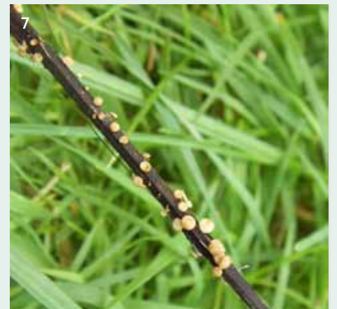
6 7 In late summer and early autumn (July to October), fruiting bodies of Hymenoscyphus can be found on blackened rachises (leaf stalks) of ash in damp areas of leaf litter beneath trees. These do not necessarily belong to the pathogen but can be tested to determine their identity.