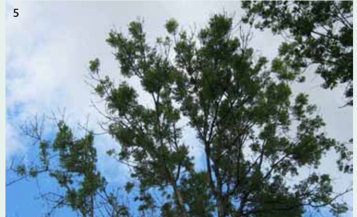
4 5 Mature trees affected by the disease initially display dieback of the shoots and twigs at the periphery of their crowns. Dense clumps of foliage may be seen further back on branches where recovery shoots are produced.