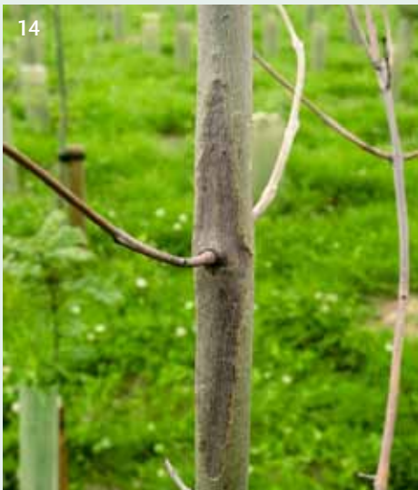
14 Older lesion centred on a dead side shoot.