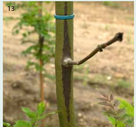
13 Developing lesion centred on a dead side shoot.