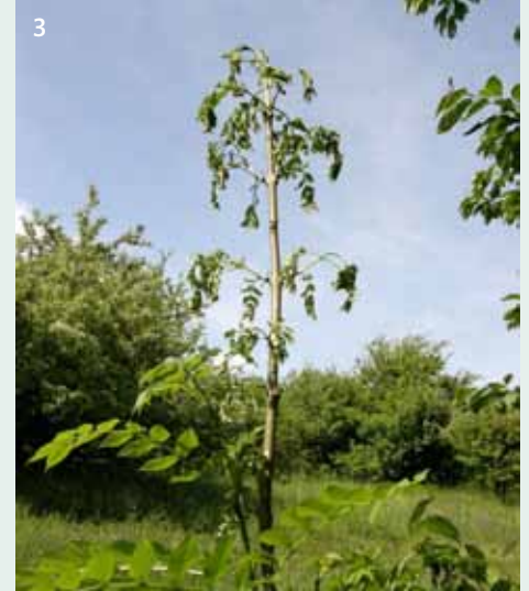
3 Lesions which girdle the branch or stem can cause wilting of the foliage above.