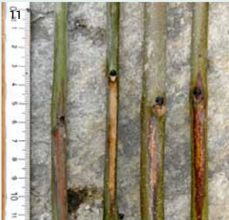
11 Developing lesions associated with leaf scars.